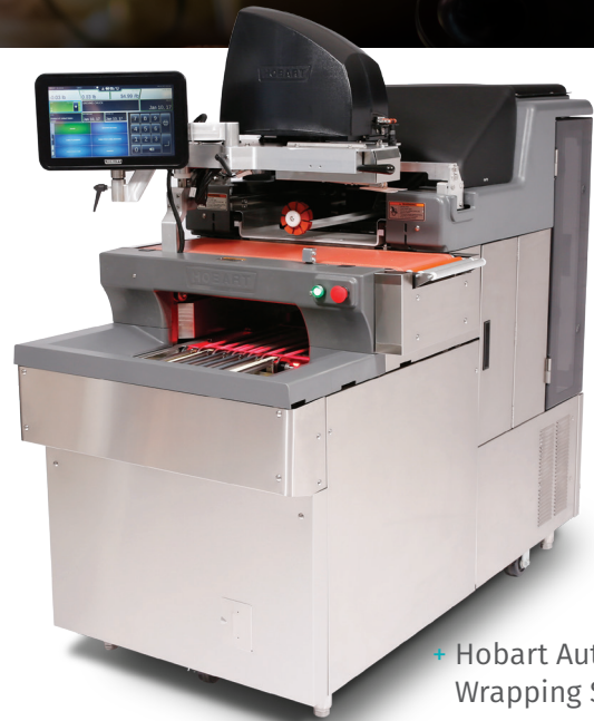
+ Hobart Automatic Wrapping Systems